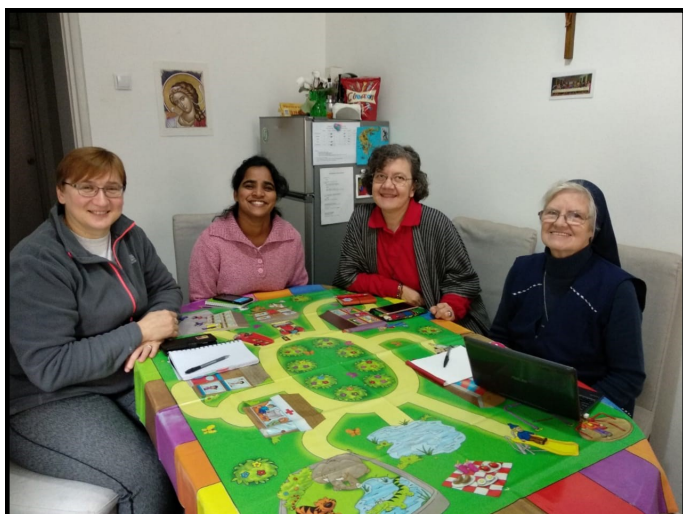
Our Sisters In Athens, Greece:

According to the information our Sisters have, there are currently about 60,000 refugees in Greece. In Athens, many live in empty, old hotels or unused buildings the city has made available to them.