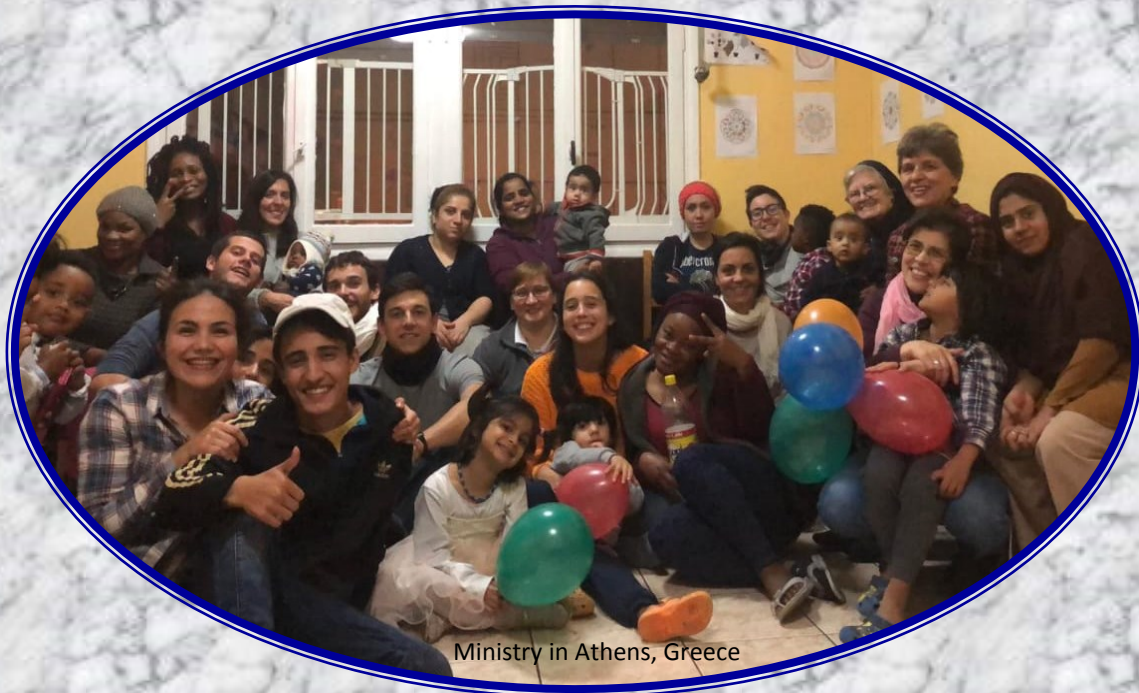
Ministry in Athens, Greece

Missionary Sisters Servants of the Holy Spirit Paraclete Province — USA and Caribbean August 2019