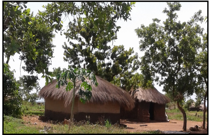
The small huts (homes) of the refugees.

Members of the St. Arnold Janssen Family (SVD priests and Brothers and our SSpS Sisters) are serving the most needy refugees at the Bidi Bidi Camp in Uganda. It is the largest refugee camp in the world. There are three hundred thousand refugees living in this camp. The camp is divided into five zones and there are four chapels in each zone. Our Sisters travel every day to serve God's people as they rotate each month in the five zones. The Sisters are serving the women, children, youth, and young girls, as well as those afflicted with leprosy in the camp. They created projects to help women do handiwork for decorations and knitting projects for making bedsheets, as well as tailoring projects, all of which help the women to support themselves. Occasionally, from the four chapel areas, the Sisters bring women from the camp to their convent. For 3-4 days, the Sisters have a time for prayer and recollection with the women and share meals with them. The women experience the abundance of God's love for them through the ministry of the Sisters. They are so happy, and they take time to share their African dances and perform the African "lulu" of joy.