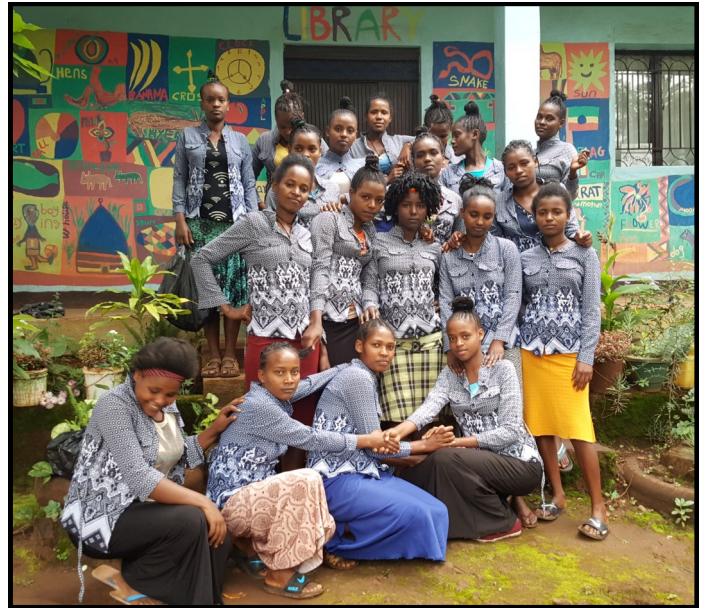
Some of the participants in the projects sponsored by the Sisters in Badessa, Ethiopia.

Within the project we have a program which tries to teach the young girls to say “no” to such practices since it is harming many young girls and women. But we have a long way to go, due to the cultural misconceptions concerning the circumcision of young girls and women. We try our best to support these young people, but when many return home they are still forced by their families and subjected to the practice.